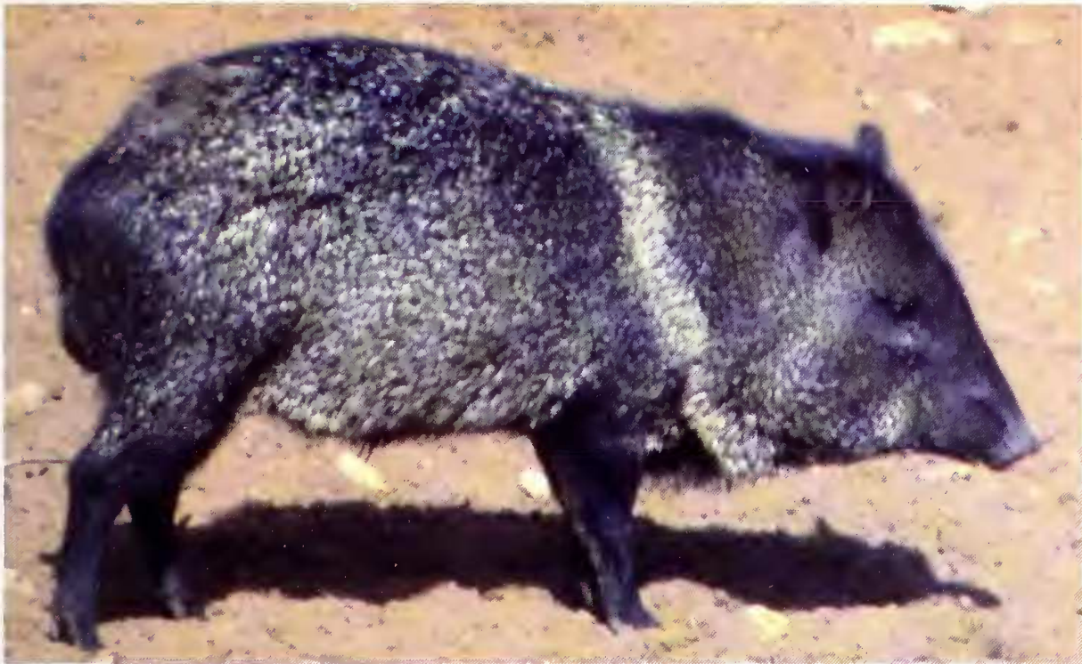
Fig. 5. Live Pecari tayacu , congener of P. maximus to show the different body proportions.